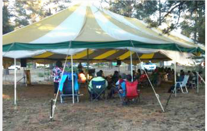
Classis Red Mesa has been hosting the Cottonwood Pass Bible Conference for nearly 100 years.